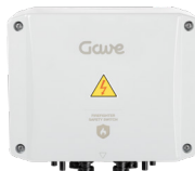
Fire safety switch 2 Strings