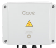
Fire safety switch 1 String